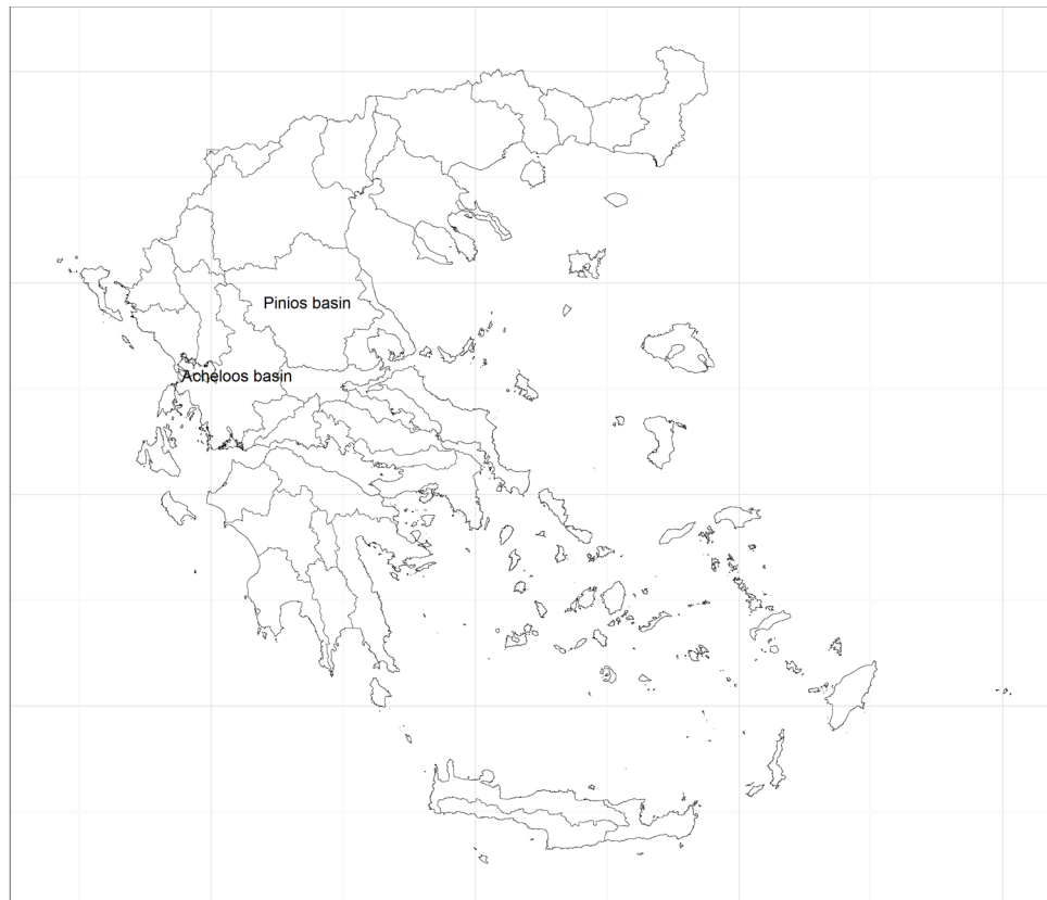
Figure 1. Major hydrological basins of Greece with marking of the Acheloos and Pinios basins.

the RBD of Western Sterea Hellas, which includes the Acheloos river basin, is hydrologically rich. The RBD of Thessaly is an important region for the Greek agricultural sector, but an increase in the agricultural production resulted in shortage of water resources and environmental degradation [Koutsoyiannis et al., 2002]. The RBD of Western Sterea Hellas has been crucial for hydropower as Acheloos produces the 35% of hydro energy in Greece [Efstratiadis et al., 2012], while the needs for urban water supply and irrigation are very small in comparison to water availability [Koutsoyiannis et al., 2008]. To solve the problem of the RBD of Thessaly, the water transfer from Acheloos to the Pinios basin has been proposed. This project is known as the Acheloos diversion scheme, and achieves the co-management of water of both basins.