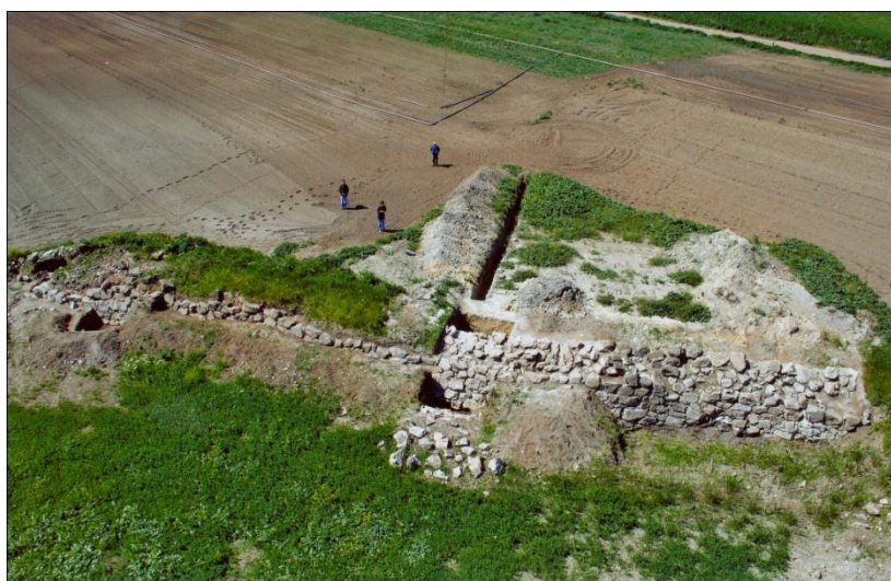
Figure 5. View from the North of the northern retaining wall of the levee (Doufexis plot).

Fifth, the exterior sides of the levee are invested with strong retaining walls, built in the Cyclopean masonry style (Fig. 5).