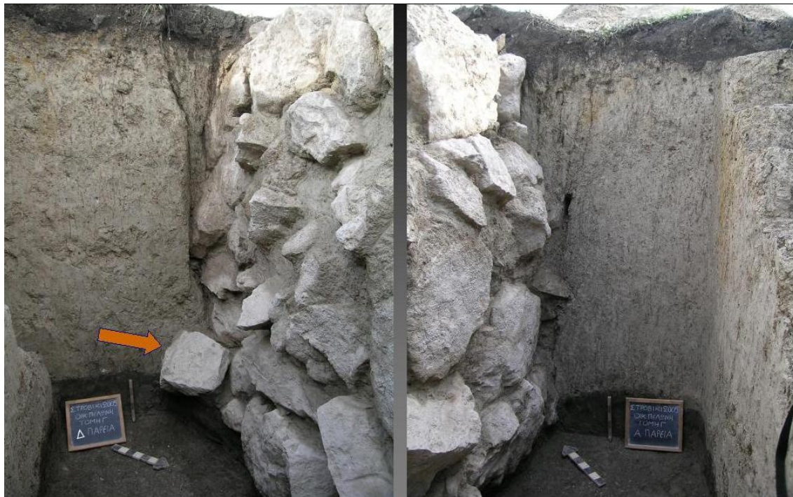
Figure 7. Stratigraphy of the core of the levee.

In one case, at the lowest level of this layer of clay, a large stone was found, having fallen from a higher course of the retaining wall. Around it, a small quantity of stone chips indicates that the boulders were roughly hewn on the spot.