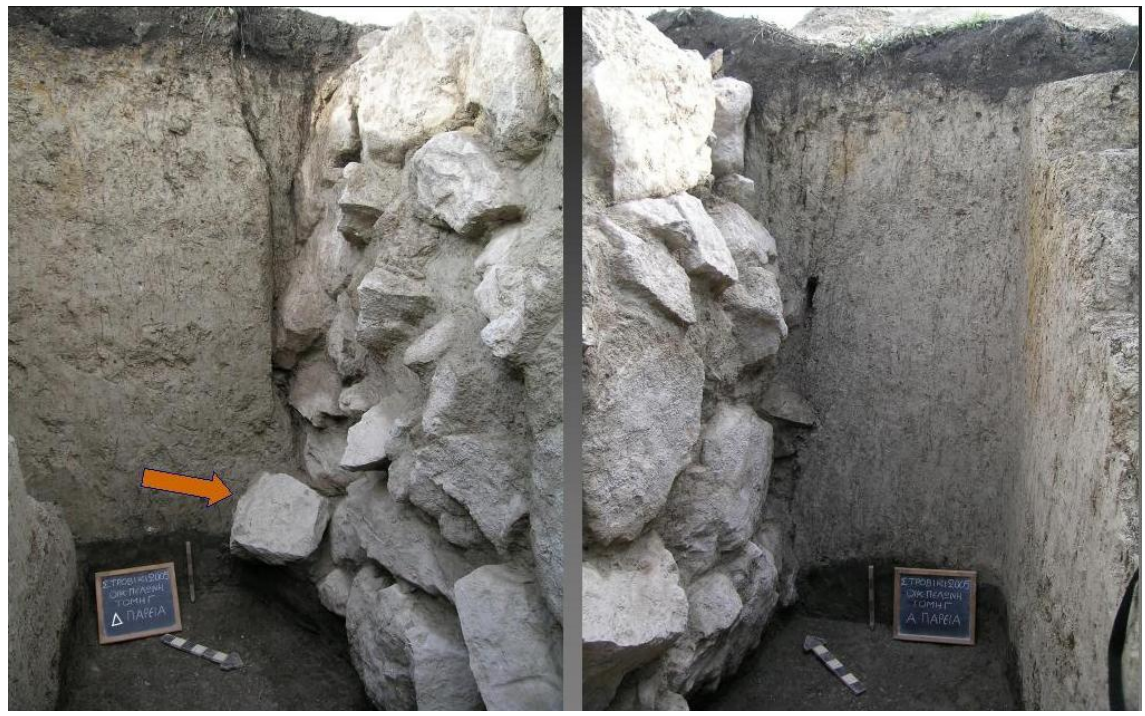
Fig. 8: Stratigraphy of the core of the levee.

Seventh , the retaining walls did not have the same dimensions everywhere. These were often dictated by the geomorphology of the area and proximity to the limestone slopes and the sink holes. The total width of the wall at the site of Anteras, including the two Cyclopean segments which marked its northern and southern long sides, measures 30 m.