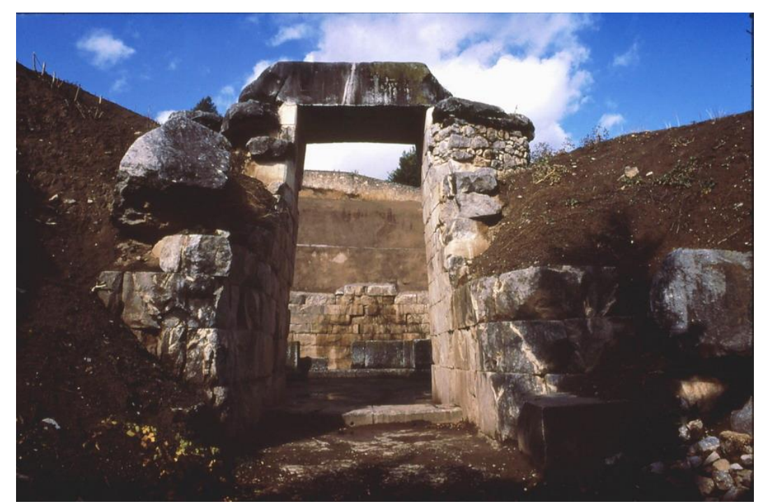
Fig. 2: Façade of the Mycenaean tholos tomb of Minyas at Orchomenos.