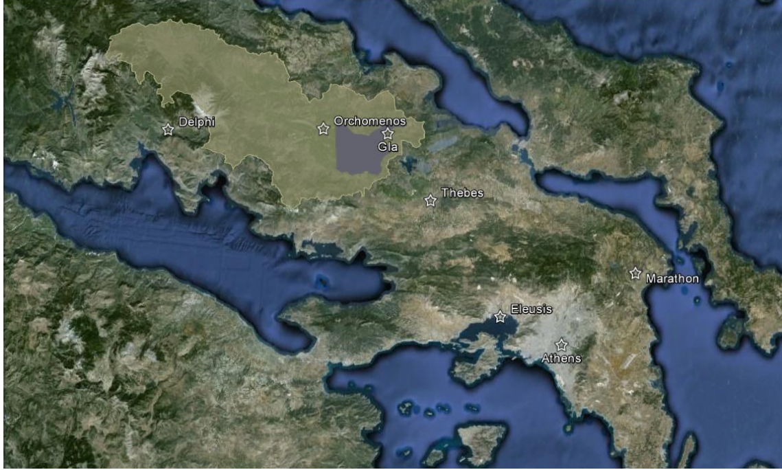
Fig. 1: Map of the Boeotian Kephisos basin and the former Kopais Lake (grey area between Gla and Orchomenos) at the center of mainland Greece.

satellite settlements; in the southern part with the extensive fertile plain of Thebes, the plains of Asopos, Tanagra and the coast of the Euboean Gulf, Thebes was dominant, being supported by an analogous regional settlement pattern.