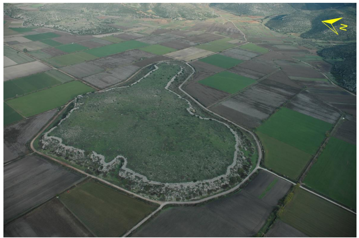
Fig. 3: Aerial photograph of the citadel of Gla.

The enormous installation of Gla (e.g. Iakovidis 1983; 1998) built on a natural island in the east creek of the lake ( Fig. 3 ) is located close to Orchomenos. The citadel was constructed in the early thirteenth century BC by Mycenaeans from Orchomenos, along with the works for the drain of Lake Kopais. It is girt by a Cyclopean enceinte pierced with four gateways; remnants of large buildings, clearly palatial, can still be seen. The constructions on the citadel (Cyclopean wall, residences of officials and granaries) were built contemporaneously. This ensemble has been interpreted as part of an ambitious plan for supervising the drainage installations, as well as collecting and storing the production of the plain. Gla was destroyed in the late 13<sup>th</sup> century BC. 3