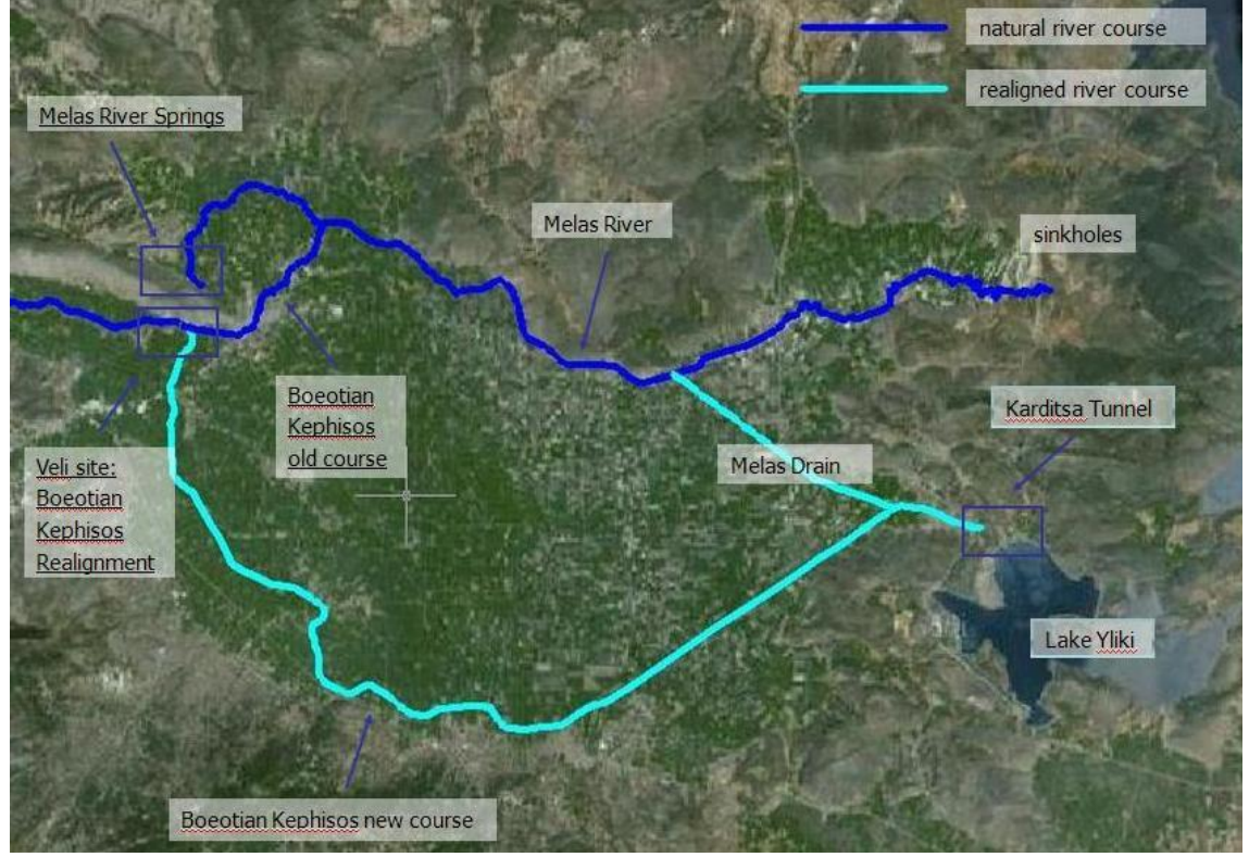
Fig. 4 : Topographic overview of the Kopais Basin in Boeotia with the location of the main river courses.

Greece contains several closed (endorheic) basins and plateaus, usually surrounded by mountains of karstic limestone and drained by natural sinkholes. The Boeotian Kephisos basin, on the Eastern Central Greece, north of Athens, is the largest one, covering an area of about 2000 km<sup>2</sup> ( Figs. 1 , 4 ).