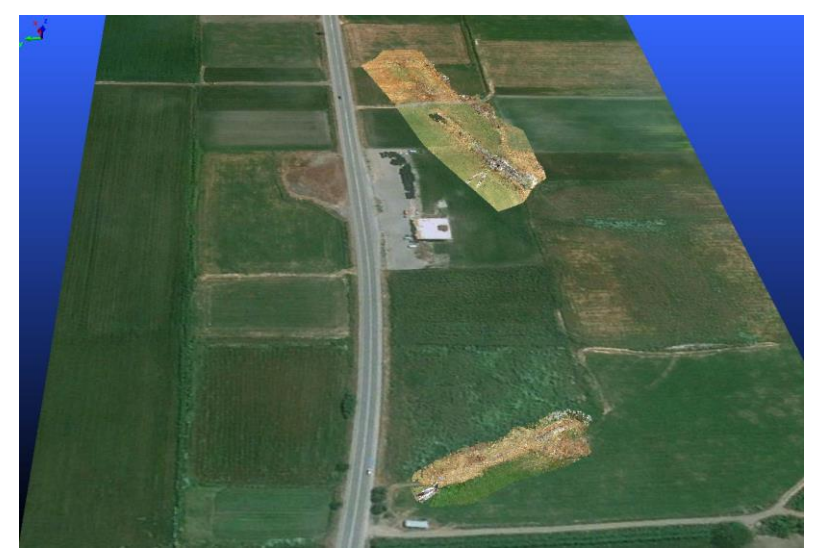
Fig. 5: 3D terrestrial laser scanning of the excavated parts of the levee.

Fourth , the constancy of the water supply of the Melas River in yearly terms made it suitable to be used for irrigation and in domestic settlements, without requiring more complicated artificial reservoirs for floodwater retention. Further investigation is needed in order to certify whether the Mycenaean infrastructures included the construction of polders and artificial reservoirs for floodwater retention and storage.