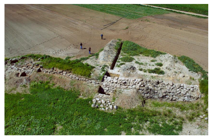
Fig. 6: View from the North of the northern retaining wall of the levee (Doufexis plot).

Fifth , the exterior sides of the levee are consolidated by strong retaining walls, built in the Cyclopean masonry style ( Fig. 6 ). These walls improved the resistance of the levee to the pressure of the water and hindered the erosion of the soil. At the same time, they provided a strong retaining infrastructure for the possible construction of a road along the top of the levee, by the creation of an artificial plateau. The exterior face of the retaining wall is sloped at an angle of 78 degrees; the stones of the lower courses protrude markedly from those of the upper courses. The well-built walls are preserved to a height of 2.30 m, having a width of 1.78 m at the top and 2.78 m at the base ( Fig. 7 )