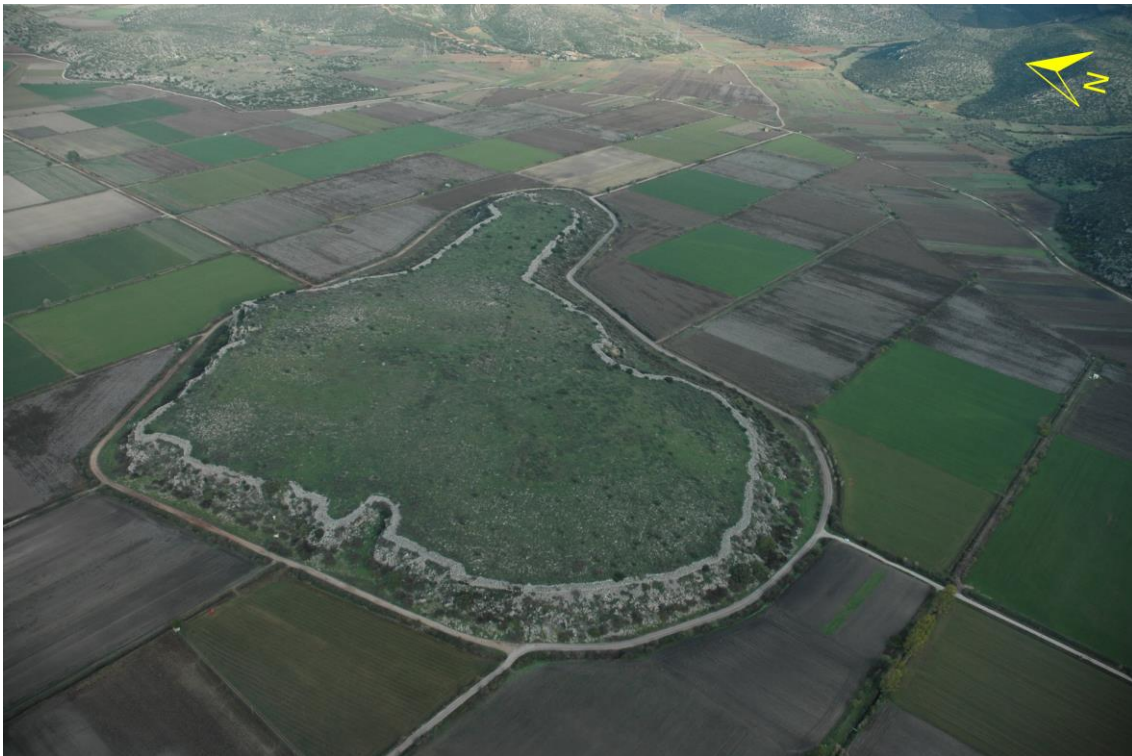
Fig. 3: Aerial photograph of the citadel of Gla.

The enormous installation of Gla (e.g. Iakovidis 1983; 1998) built on a natural island in the east creek of the lake ( Fig. 3 ) is located close to Orchomenos. The citadel was constructed in the early thirteenth century BC by Mycenaean from Orchomenos, along with the works for the drain of Lake Kopais. It is girt by a Cyclopean enceinte pierced with four gateways; remnants of large buildings, clearly palatial, can still be seen. The constructions on the citadel (Cyclopean wall, residences of officials and granaries) were built contemporaneously. This ensemble has been interpreted as part of an ambitious plan for supervising the drainage installations, as well as collecting and storing the production of the plain. Gla was destroyed in the late 13 th century BC. 3