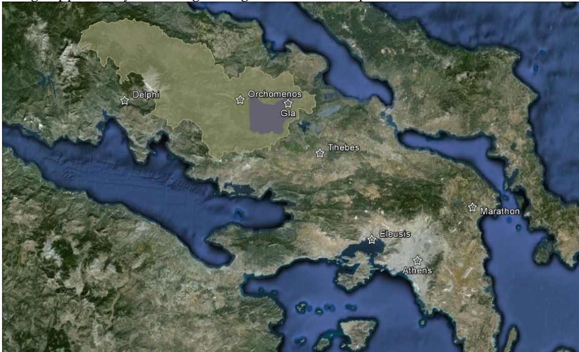
Fig. 1: Map of the Boeotian Kephisos basin and the former Kopais Lake (grey area between Gla and Orchomenos) at the center of mainland Greece.

satellite settlements; in the southern part with the extensive fertile plain of Thebes, the plains of Asopos, Tanagra and the coast of the Euboean Gulf, Thebes was dominant, being supported by an analogous regional settlement pattern.