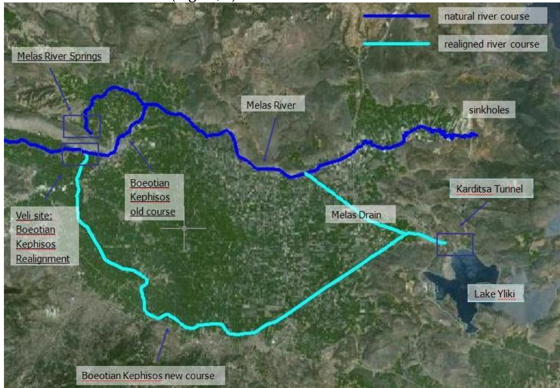
Fig. 4: Topographic overview of the Kopais Basin in Boeotia with the location of the main river courses.

Greece contains several closed (endorheic) basins and plateaus, usually surrounded by mountains of karstic limestone and drained by natural sinkholes. The Boeotian Kephisos basin, on the Eastern Central Greece, north of Athens, is the largest one, covering an area of about 2000 km 2 (Figs. 1, 4).