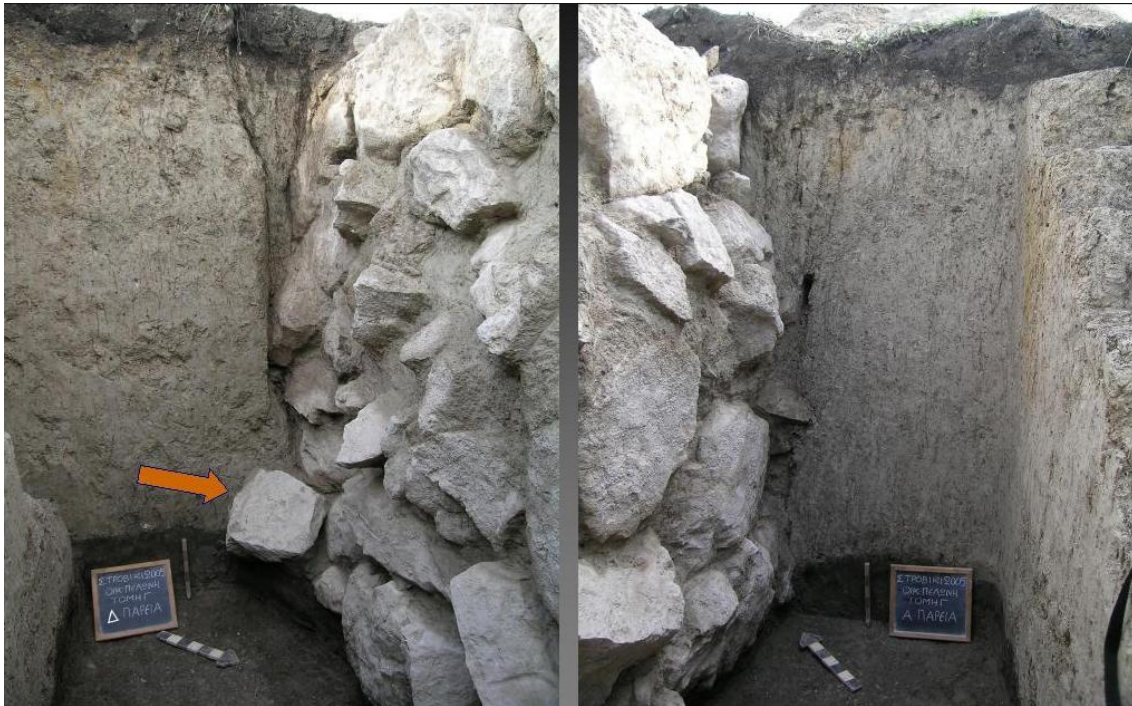
Fig. 8: Stratigraphy of the core of the levee.

Seventh , the retaining walls did not have the same dimensions everywhere. These were often dictated by the geomorphology of the area and proximity to the limestone slopes and the sink holes. The total width of the wall at the site of Anteras, including the two Cyclopean segments which marked its northern and southern long sides, measures 30 m.