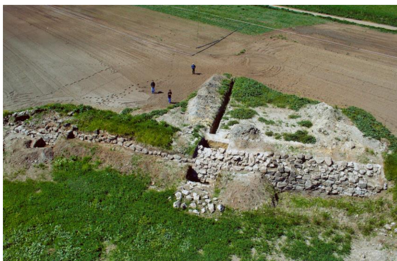
Fig. 6: View from the North of the northern retaining wall of the levee (Doufexis plot).

Fifth , the exterior sides of the levee are consolidated by strong retaining walls, built in the Cyclopean masonry style ( Fig. 6 ). These walls improved the resistance of the levee to the pressure of the water and hindered the erosion of the soil. At the same time, they provided a strong retaining infrastructure for the possible construction of a road along the top of the levee, by the creation of an artificial plateau. The exterior face of the retaining wall is sloped at an angle of 78 degrees; the stones of the lower courses protrude markedly from those of the upper courses. The well-built walls are preserved to a height of 2.30 m, having a width of 1.78 m at the top and 2.78 m at the base ( Fig. 7 )