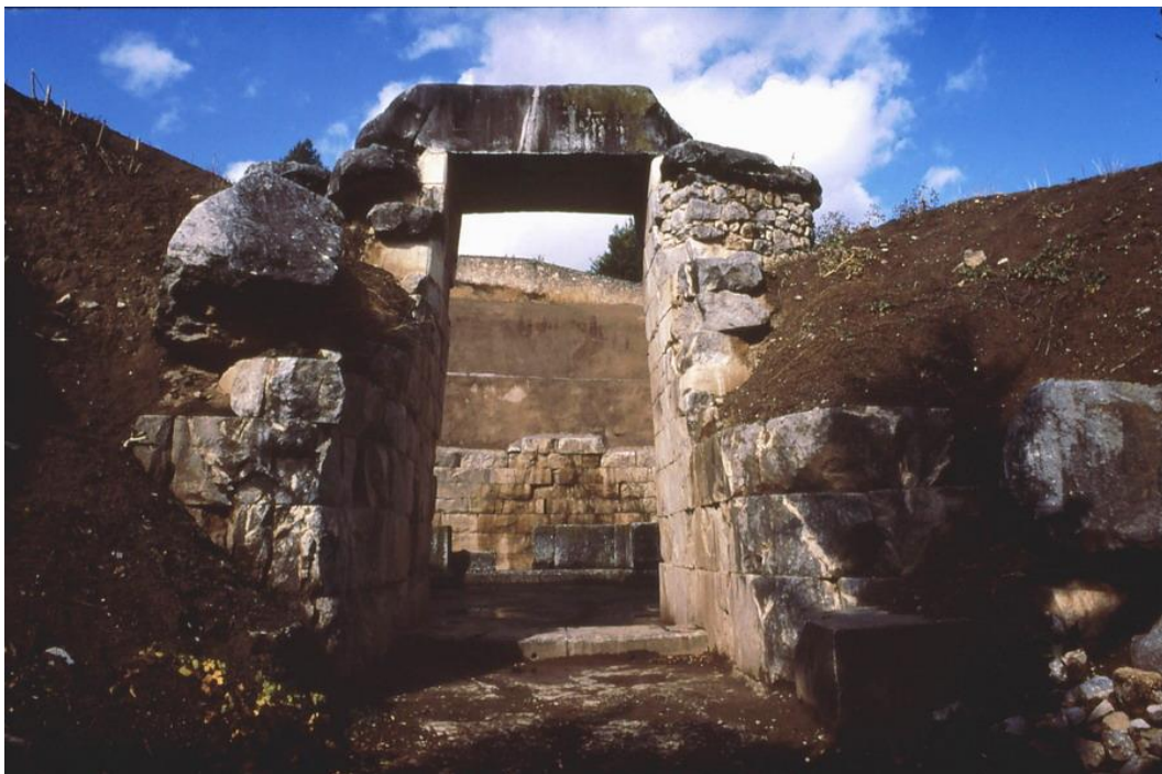
Fig. 2: Façade of the Mycenaean tholos tomb of Minyas at Orchomenos.