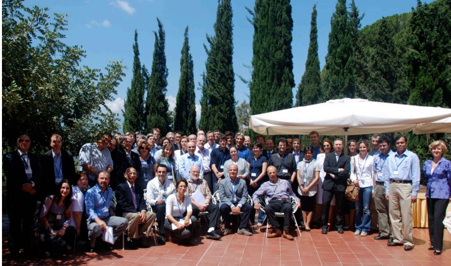
Taormina, Italy, 2010