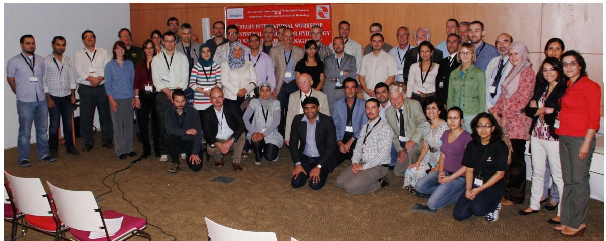
Tunis, Tunisia, 2012