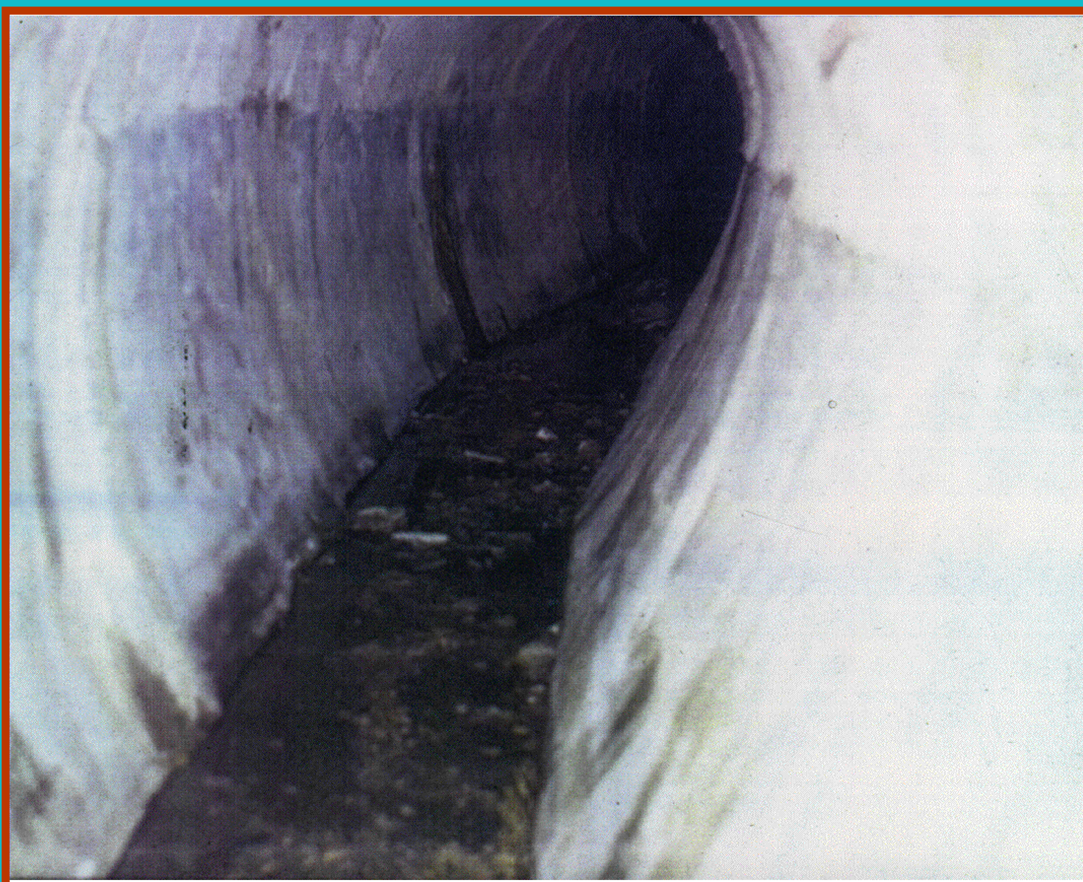
Figure 3 Coarse granular deposit in the egg shaped sewer at Ptolemaidos St., upstream of a sewer bend. Survey on 25/05/96.