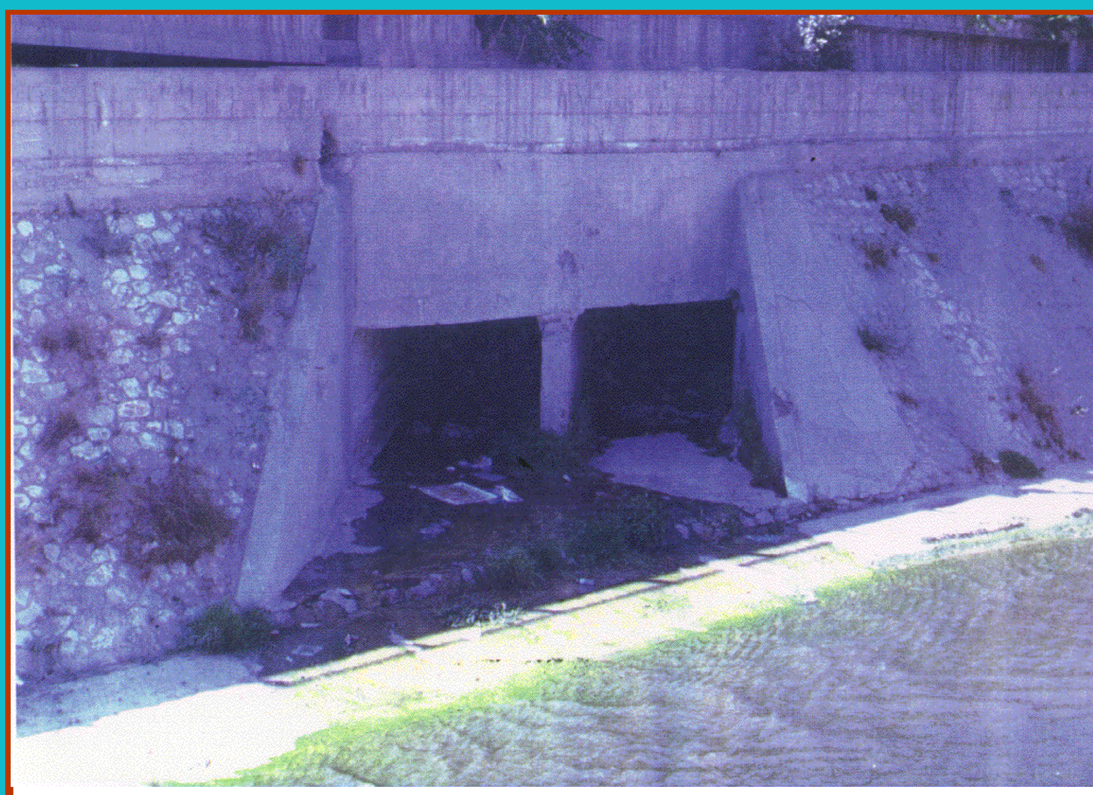
Figure 4 Fine thick (50 cm) deposit in the outlet of the K27 sewer to the Kifissos River. Survey on 25/05/96. The outlet is submerged during intense floods of the Kifissos River.