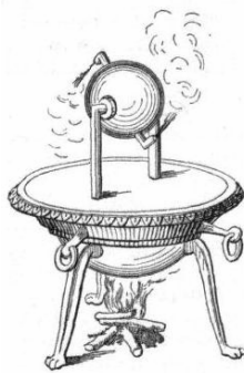
Figure 4 Hero's steam engine.