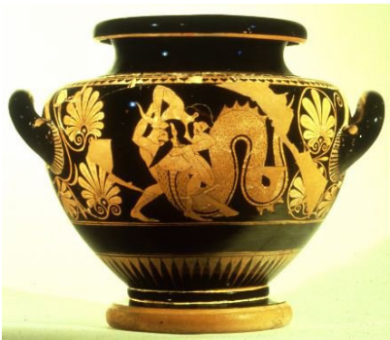
Figure 1 Attic red figure vase, 6th century B.C. depicting the battle of Hercules against Achelous (British Museum).

Reviewing the original texts of this period, the researcher meets a great variety of theories that extended from mythological explanations based on epics (Homer, Hesiodus), to scientific views. Inside this prosperity, the modern investigator can perceive mythical, poetical, religious, symbolical, philosophical and scientific views. Interestingly, the mythological and symbolical views have been popular even in the late stages of this period, even though scientific theories had already been developed. This is depicted for instance in the Wind Tower, a monument built in Athens in the 2nd or 1 st century B.C., where the winds are shown as deities (Fig. 2).