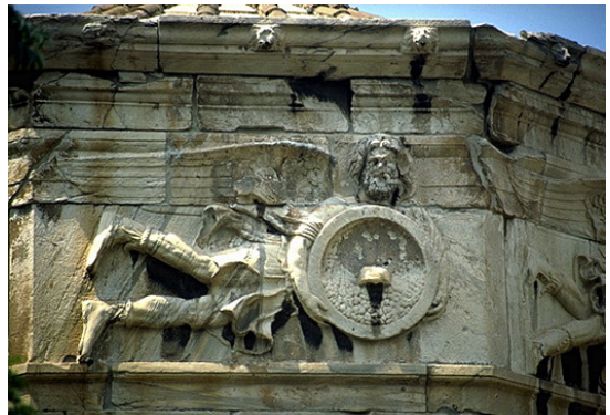
Figure 2 Detail of the Wind Tower in Athens showing Kaikias, the northeast wind holding a shield with hail-stones [Available online at: www.stoa.org/athens/sites/romagora/source/p06059.html ].

Today even the scientific views of ancient Greeks are not useful for the explanation of the hydrometeorological phenomena. The modern scientific basis is very solid (even though several phenomena are not fully understood until today) and seems to be totally independent of the ancient Greek scientific views. However the study of the ancient science is still useful because it reveals that thinking and reasoning, which were the main tools of ancient philosophers (in contrast to modern modelling tools and computers), can establish consistent views of the world, whose precision in some cases is admirable even today (even though in some other cases the views are illogical according to modern knowledge). And also because it enlightens the continuity of the development of science as it is known that the ancient Greek ideas had a major contribution in the beginnings of modern science (during the Renaissance).