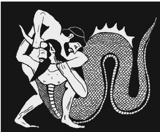
Figure 1. The battle of Hercules against Achelous (depiction based on an Attic red figure vase, 6th century BC, kept in the British Museum).

In all ancient civilizations the exploitation of the natural sources, such as sun, wind and water, was a major activity triggering cultural progress through inventions and technological advances. These achievements helped ancient communities to manage the wind for sailing, to exploit the water for drinking and irrigation and to take advantages of the solar energy by appropriate orientation of buildings. Such technological applications certainly imply some understanding of nature. However, at the first stages the related explanations were hyperphysical, i.e. mythological. In ancient Greece, the struggle of humans to control nature has been imprinted in a rich mythology which was survived in texts and artefacts. For example several myths about the hero Hercules (Heracles), symbolize the struggle against the destructive power of water. The myth depicted in Fig. 1 is related to the duel between Achelous (or Acheloos) and Hercules. Achelous, the greatest (in discharge) river of Greece, in mythology was deified as the son of Poseidon, the god of the sea. Achelous was eventually defeated by Hercules. As demystified later by the historian Diodoros Siculus (IV 35) and the geographer Strabo (X 458–459), the meaning of the victory is related to the channel excavation and the construction of dikes to confine the shifting bed of Achelous.