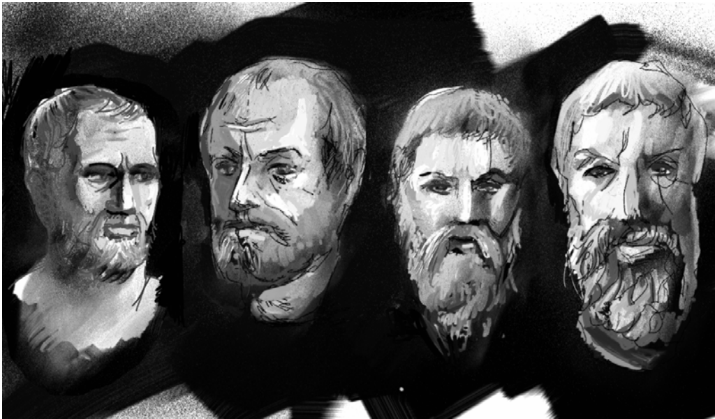
Figure 4. Athenian philosophers (from left to right: Theophrastus, Aristotle, Plato, Epicurus – a depiction based on known sculptures).

"the land reaped the benefit of the annual rainfall, not as now losing the water which flows off the bare earth into the sea, but, having an abundant supply in all places, and receiving it into herself and treasuring it up in the close clay soil, ... providing everywhere abundant fountains and rivers" (Critias, 111d; transl. B. Jowett).