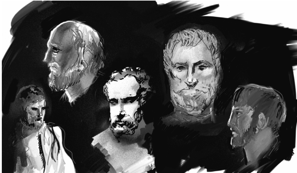
Figure 3. Ionian philosophers (from left to right: Anaximander, Anaxagoras, Xenophanes, Thales, Anaximenes – a depiction based on known sculptures).

Although the technological application in water resources started in Greece before 2000 BC, in the Minoan and Mycenaean civilizations (Koutsoyiannis and Angelakis, 2003), the first scientific views of phenomena were formulated only around 600 BC. Greek philosophers from Ionia (Fig. 3), rejected the hyperphysical approaches that were reflected in epic poems (mostly in Homer's Iliad and Odyssey), and explained many physical phenomena in a scientific manner.